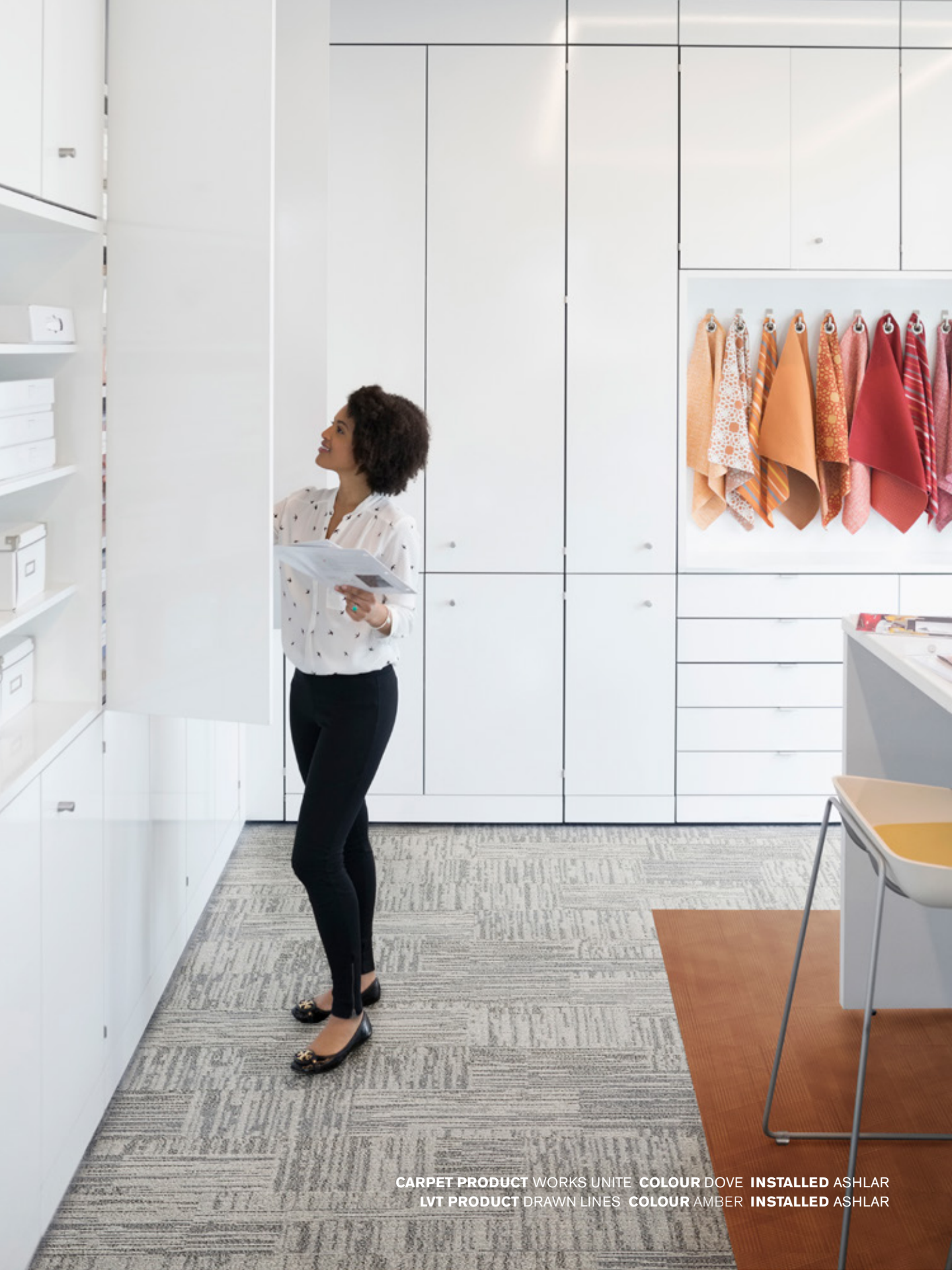
CARPET PRODUCT WORKS UNITE COLOUR DOVE INSTALLED ASHLAR LVT PRODUCT DRAWN LINES COLOUR AMBER INSTALLED ASHLAR