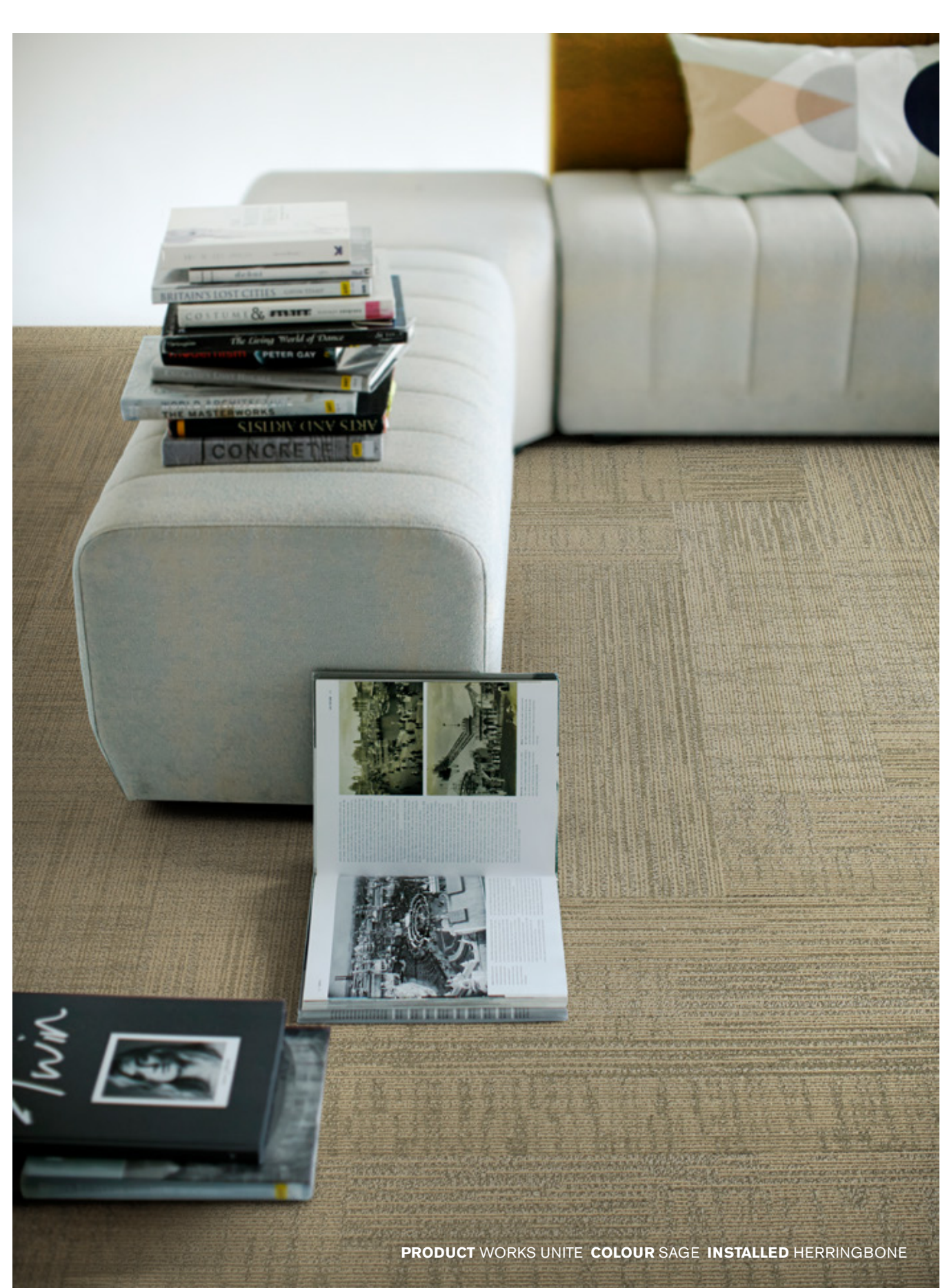
PRODUCT WORKS UNITE COLOUR SAGE INSTALLED HERRINGBONE